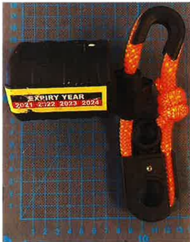
HRU one side