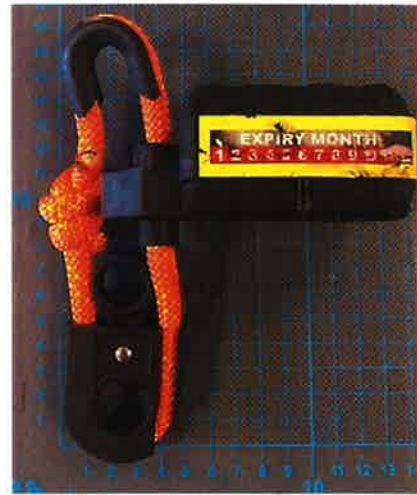
HRU opposite side