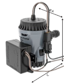
Aqua Void Automatic-Electro-Magnetic Combo