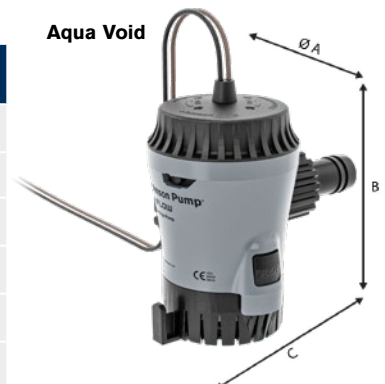
Aqua Void Automatic Ultima Combo